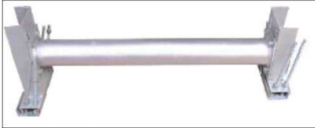
Cross Arm Mount